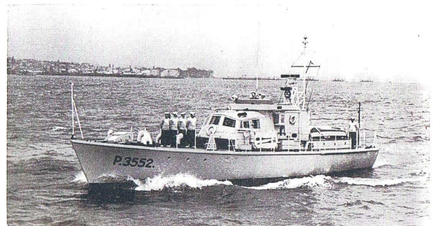
HMNZS PAEA departing Devonport Naval Base 1950's – were you onboard?