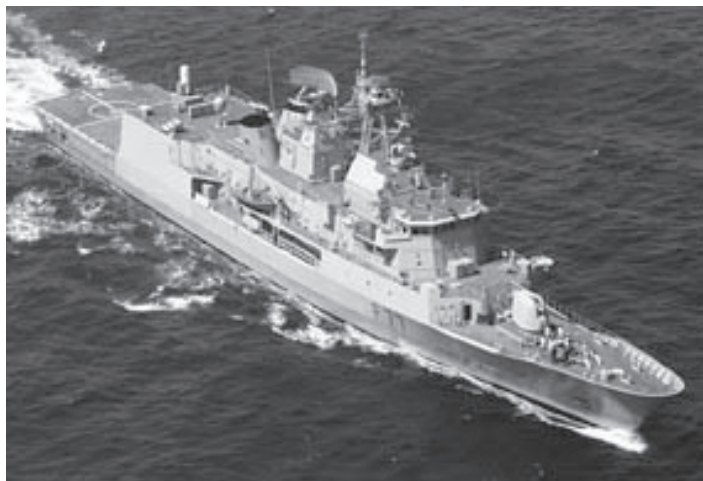
Te Mana 385 ft long, 46 ft wide, 3543 ton. That's Blackpool's old pennant, F77, Te Kaha has F111. A South African Meko class 'Mendi' has F148.