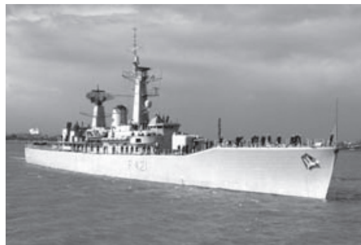
Canterbury 372 feet long, 41 feet wide, 2450 ton. You will be hard pressed to find another photo without all her frames showing.